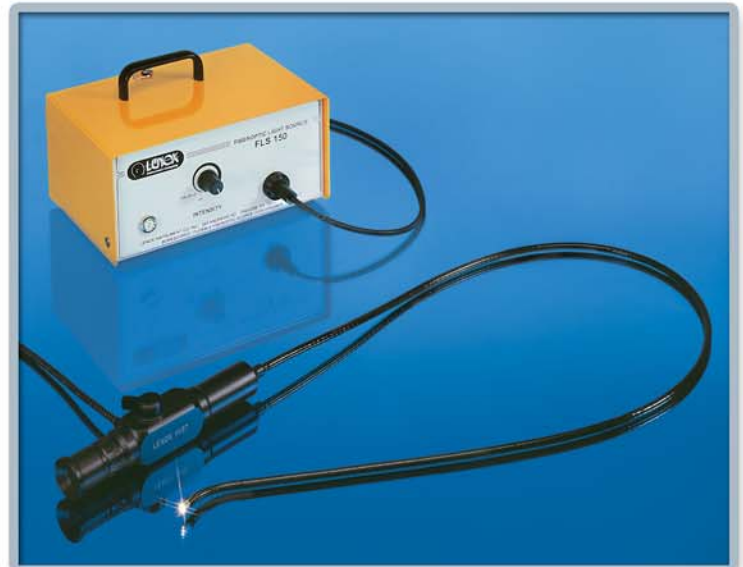
Fiberscope with optional light source

All models in the Fiberscope line are fully digital- and video-adaptable, allowing for the viewing and recording of real-time or still images for reference. Fiberscopes are compatible with other Lenox accessories such as complete color video systems and light sources (standard and portable versions) for self-contained illumination of the inspection area. Additionally, Fiberscopes are backed by Lenox's industry-leading two-year warranty.