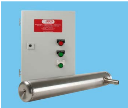
Model 6935SC Series

Lenox Furnace Camera HD high-temperature, video furnace camera systems are designed to be mounted either directly through the wall or flush with the exterior wall of a furnace. The stainless steel camera housing employs a steel triple wall laminar flow for efficient water-cooling of the color CCD camera and the latest optical lens technology to provide clear, real time high-resolution (540 line) images, enabling operation in hostile environments up to 4250°F (2345°C). An integral air-purge prevents fouling of the lens system. The furnace camera is available in lengths of 24" (61cm), 31" (79cm), 36" (92cm) and provides direct viewing with a choice of 30°, 45°, 90° field of view and zoom capabilities up to 5X.