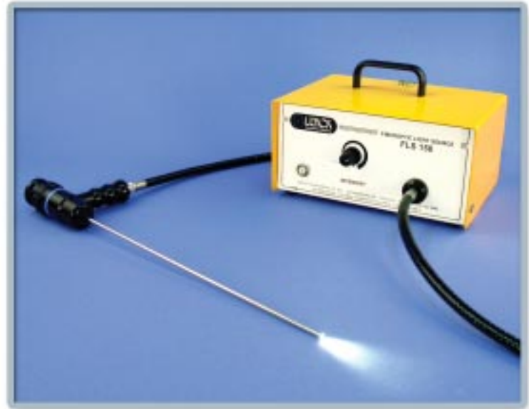
Rigid Borescope with optional light source

A complete selection of light sources, accessories, camera and video adapters and monitoring equipment are available for all Lenox Rigid Borescopes. Additionally, all Rigid scopes are backed by Lenox's industry-leading two-year warranty.