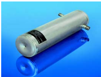
Model 6900SC Series

Lenox / Pultz high-temperature, video furnace camera systems are designed to be mounted either directly through the wall or flush with the exterior wall of a furnace. The stainless steel camera housing employs a steel triple wall laminar flow for efficient water-cooling of the color CCD camera and PH lens technology to provide clear, real time high-resolution (540 line) images, enabling operation in hostile environments up to 4250°F (2345°C). An integral air-purge prevents fouling of the lens system. The furnace camera is available in lengths of 18" (457mm), 24" (598mm), 31" (762mm) and provides direct viewing with a choice of 30°, 45°, 90° field of view and zoom capabilities up to 5X.