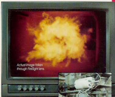
Actual image taken through FireSight lens.

Proven FireSight® remote high temperature viewing system provides image clarity never before available in boiler combustion monitoring